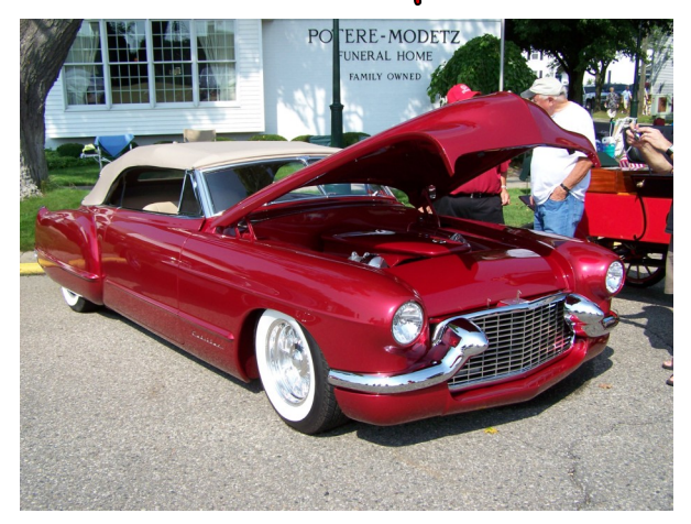
Roger Chesnut's custom Cadillac, best of show winner