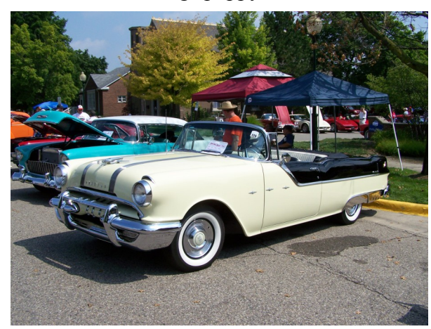
1955 Pontiac Star Chief Convertible